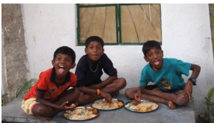
“Summer camp” lunch